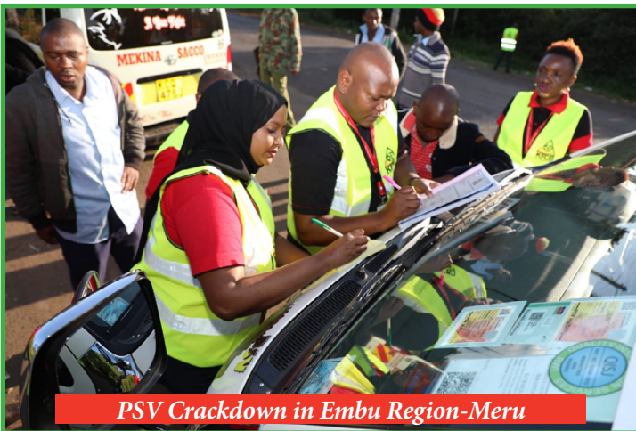
PSV Crackdown in Embu Region-Meru