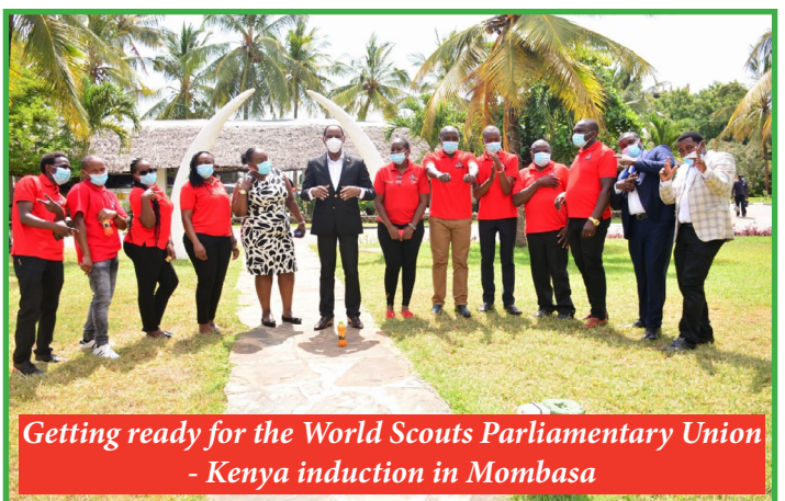
Getting ready for the World Scouts Parliamentary Union - Kenya induction in Mombasa