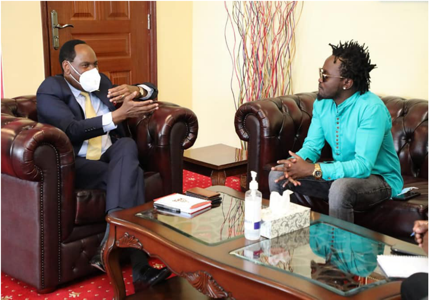
Dr. Ezekiel Mutua with Kelvin Kioko, popularly known as Bahati, during a courtesy call.

P opular musician, Kevin Kioko aka Bahati paid the Board's CEO Dr. Ezekiel Mutua a courtesy call that fostered discussions around collaborations in promoting clean content and the fight against Gender-Based