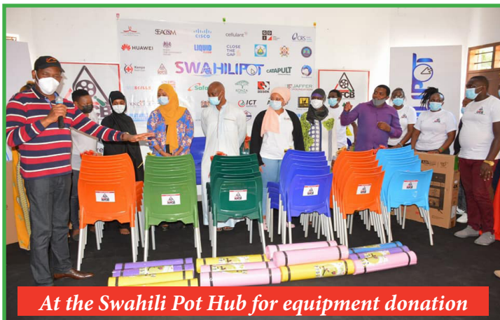
At the Swahili Pot Hub for equipment donation