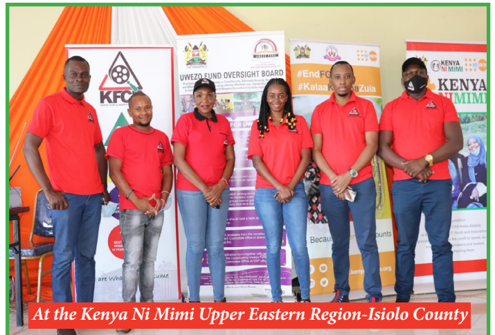
At the Kenya Ni Mimi Upper Eastern Region-Isiolo County