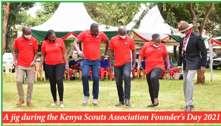
A jig during the Kenya Scouts Association Founder's Day 2021