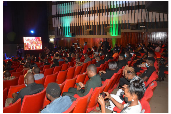
KFCB was among the key partners during the Msanii Jichanue event that targeted Creatives in Kenya, held on Friday 10th September, 2021.